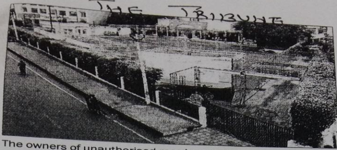
The owners of unauthorised marriage palaces can submit their applications for regularisation by June 30.